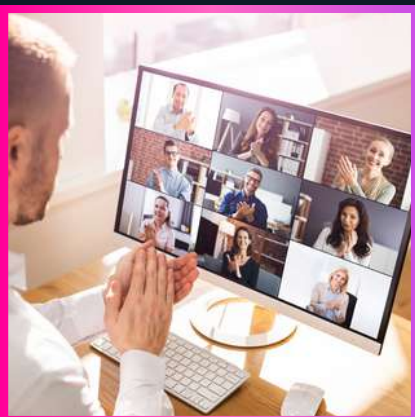
Networking Sessions for Virtual Participants