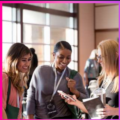
The Future of Women 2025 - Synergy Hub