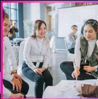
The Elephant in the Room Session