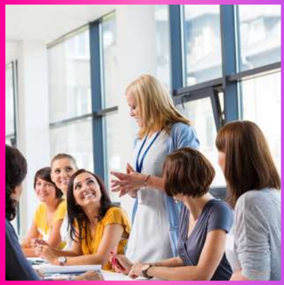
Grant Writing and Funding Strategies