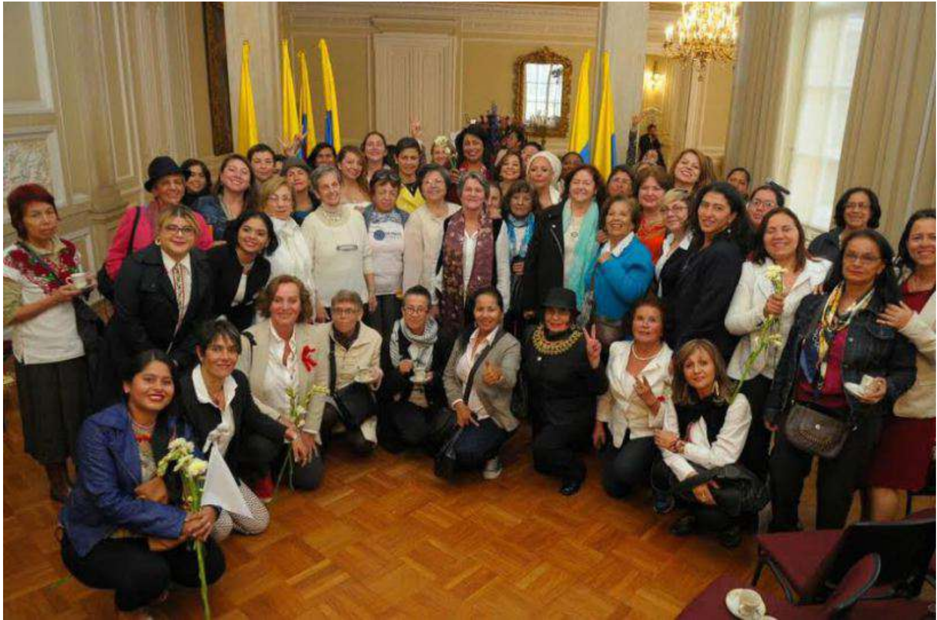
Women In a meeting held at the Casa de Nariño on Friday, October 21, supporting the peace agreement